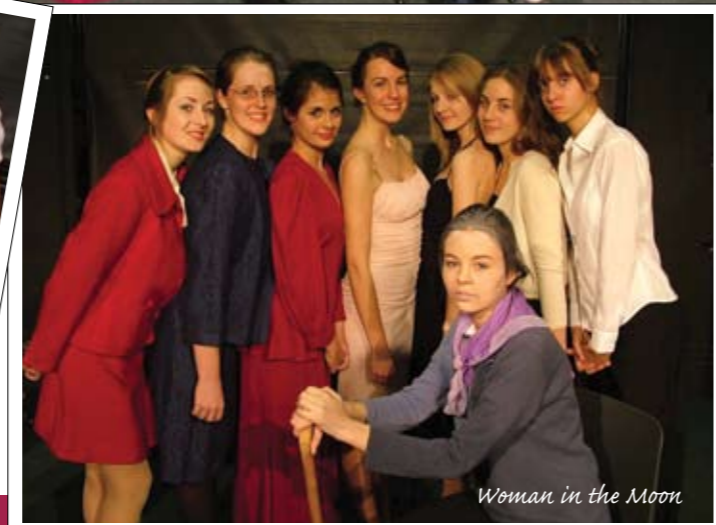
Woman in the Moon