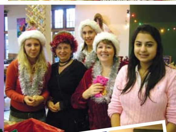
Bottom right: One of the Young Enterprise stalls at the bazaar