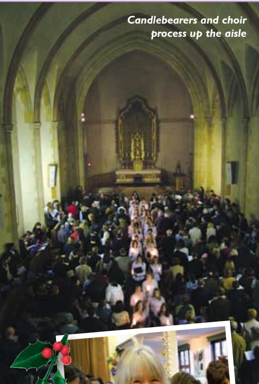
Candlebearers and choir process up the aisle