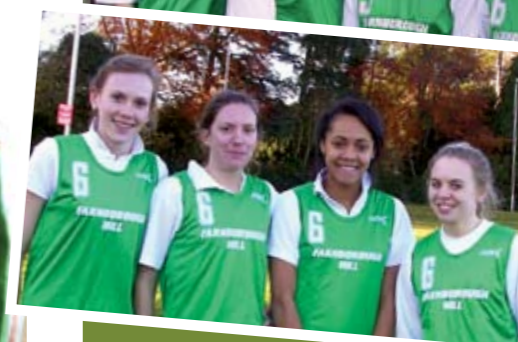
U15 (above) and U17 (left) cross country teams