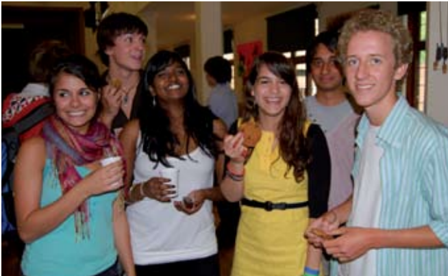
Farnborough Hill and Salesian College Sixth Formers socialising during their joint General Studies programme which takes place every Wednesday afternoon on the Hill.