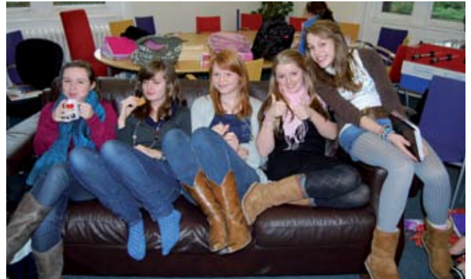
Above: Year 11 enjoying the benefits of the new Sixth Form Common Room and kitchen/cafe for a day. This wonderful new facility provides Upper and Lower Sixth Formers with a pleasant area to meet and relax and has been furnished with leather sofas, chairs and tables, plasma screen TV, table football machine and a new kitchen and eating area.