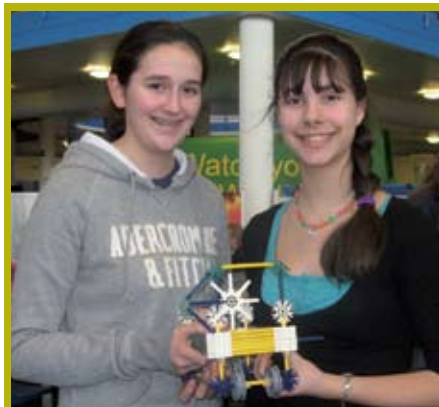
Year 9 enjoyed their trip to INTECH in Winchester to see a show in the largest planetarium in the country, learn about science from the 'hands on' exhibits and take part in an engineering challenge to make the fastest buggy.

Six Year 9 students are preparing their entry into a unique competition run by Virgin Galactic to celebrate the start of their programme of space flights, the first ever to be open to the general public. The team, called 'The Farnborough Hill Spacesavers', is designing a marketable product that demonstrates a scientific principle involved in such space flights.