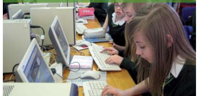
Year 7 students competing in World Maths Day

Years 7, 8 and 9 took part in a global celebration of numbers for World Maths Day . The girls played against other students from around the world in real-time mental arithmetic games and helped contribute to the 452,681,681 questions correctly answered during the day. They improved their numeracy skills whilst having lots of fun in the process!