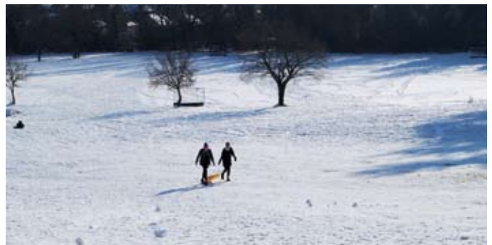
The girls enjoyed the snow break – plenty of space for sledging on the Hill!!