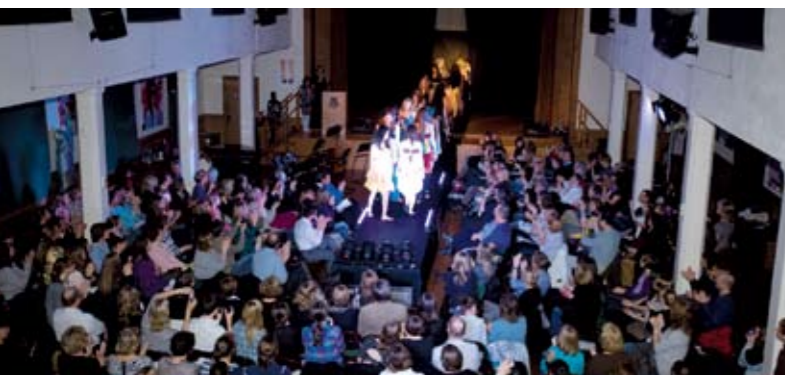
The charity fashion show in aid of Frimley Park Hospital's Heart 2 Heart appeal was hugely entertaining for the packed audience and our students. Clothes from River Island and students' recycled 'eco' and GCSE garments were modelled. The girls looked professional and stylish with hair and make-up expertly done by students from Farnborough College of Technology whose help was very much appreciated.