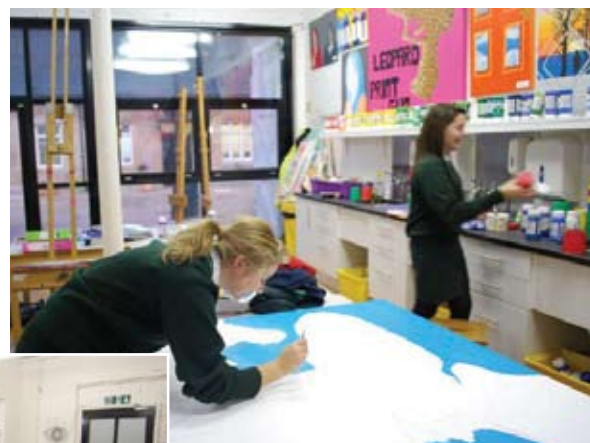
Above: Art Studio