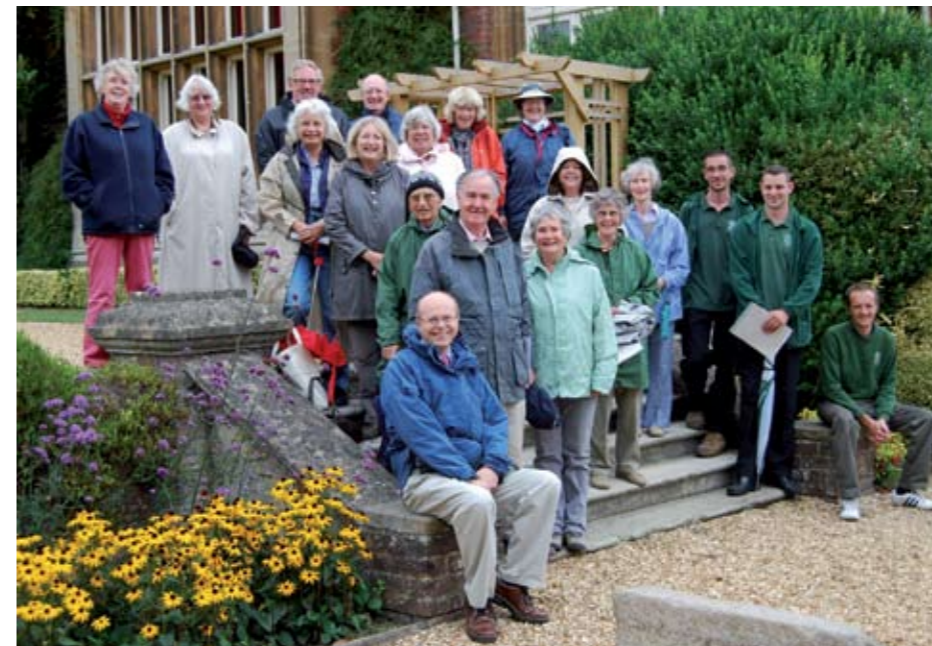
A group from the Hampshire Gardens Trust came in the summer to hold a training day on the horticultural history of our site.