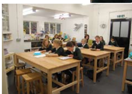
Left: Ceramics Studio