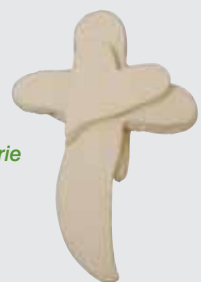
Cross by Kloe Storrie