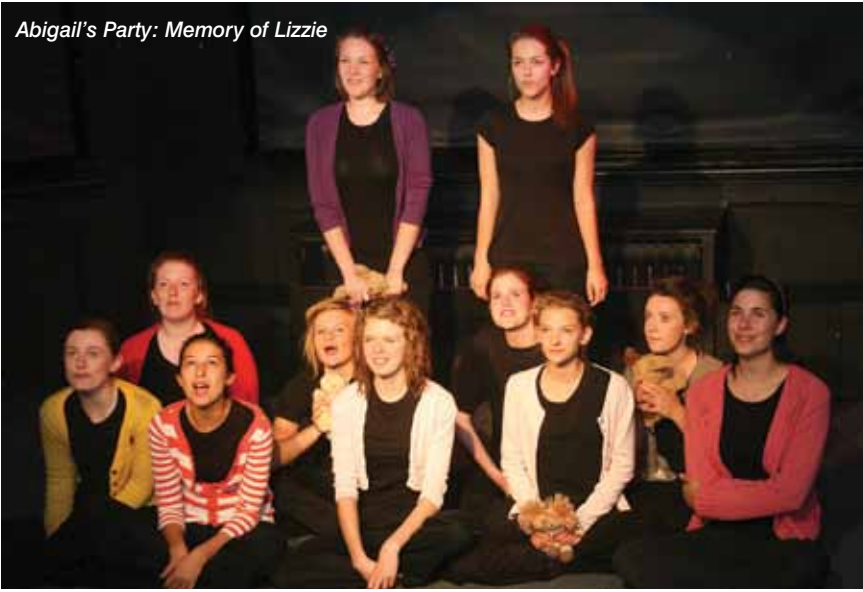
Abigail's Party: Memory of Lizzie