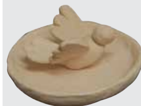
Dove