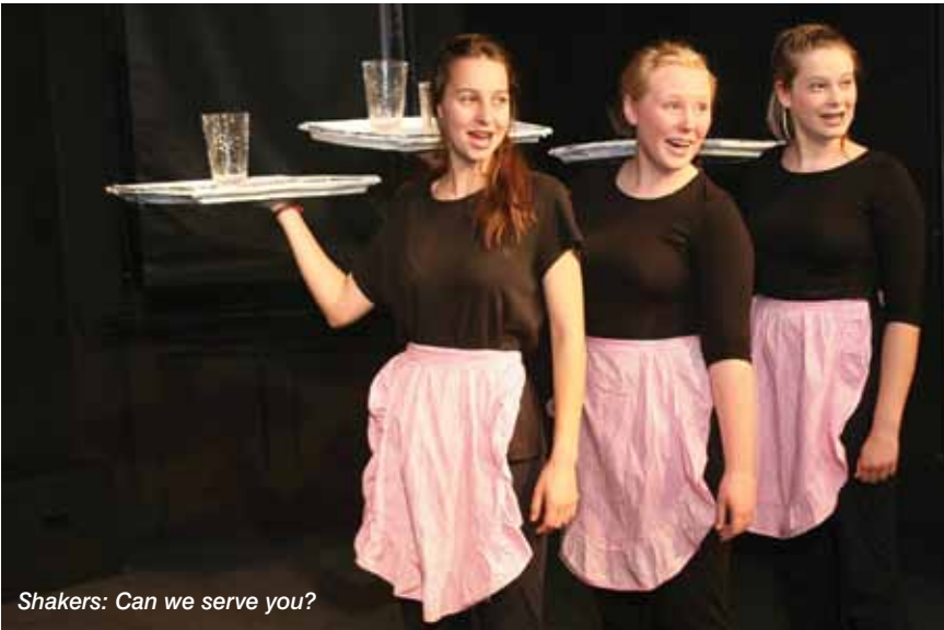
Shakers: Can we serve you?